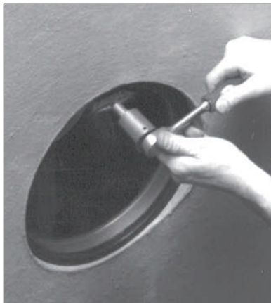
Install Kor-N-Seal I - Wedge Korbond with Socket Wrench & Torque Limiter