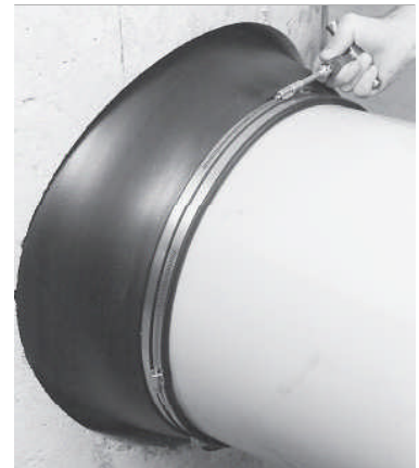
Install Pipe Clamp(s) with T-Handle Torque Wrench